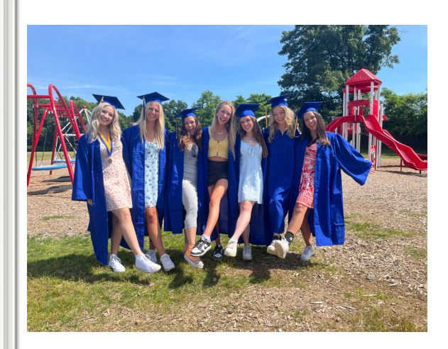
Congratulations to all 2024 graduating High School Seniors. We can't wait to see what you do