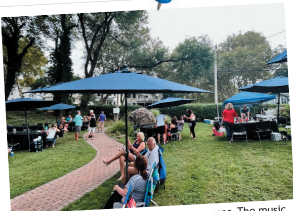
This event is going to get better every year. The music can change (yacht rock anyone?) but a Valley Grove Sunset is the always the perfect accompaniment. ** Thank you, members!