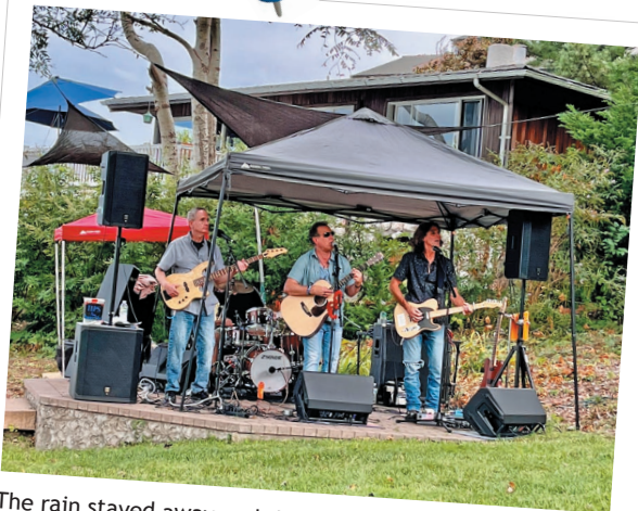
The rain stayed away and the Division Street Band rocked "The Grove" for hours with a wide array of classic hits during POENB's Endless Summer party on September 9th.