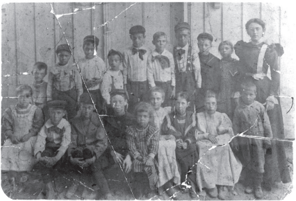
The Eaton's Neck Schoolhouse Prepares another group of students.

The school was built in 1822 to educate the children of the Gardiner Family who owned Eaton's Neck at the time. In 1823, ten children from the family attended. When the children completed their studies in the mid 1840s, the school was discontinued.