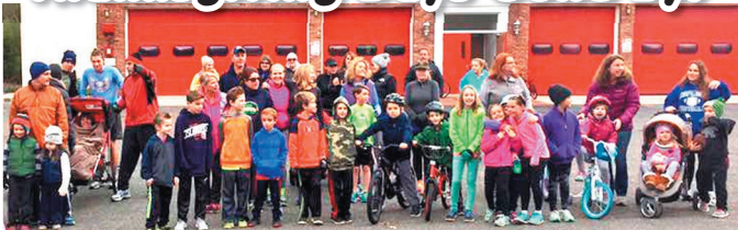
Before the turkey goes in the oven, the turkey trotters hit the streets. This archival shot was from 2017. Good luck to all our runners this year!