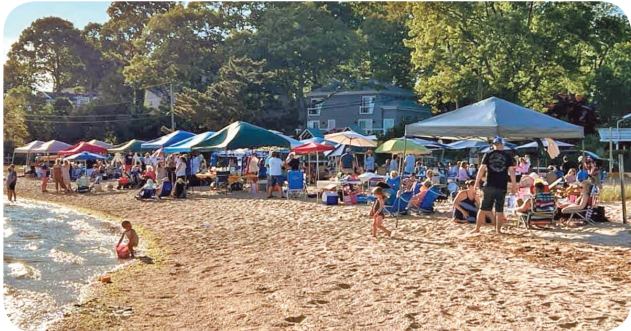
Our Parti-Gras ushers in the start of our '23 Beach Season

The Pledge of Allegiance was recited followed by a roll call of officers.