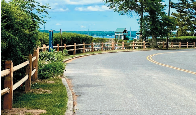
New fencing was installed at Price's Bend in early June

2023 Watercraft Assignments are now available on the POENB website at eatonsneck.org/watercraft .