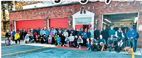
POENB's Turkey Trot 2022 was a huge success. Fun photos can be found throughout this issue!