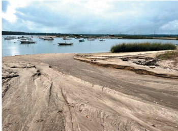
(Price's Bend washout - 9/13/22)

On September 13th Eaton's Neck experienced its third severe weather event in 8 weeks. In a torrential downpour between 4-6 am, the newly-installed drainage system again proved unable to handle the sudden quantity of rain. Water pooled up, overtopped curbs and carved new paths toward LI Sound, eroding large sections of Prices Bend and Valley Grove as well as damaging our stairs at VG yet again.