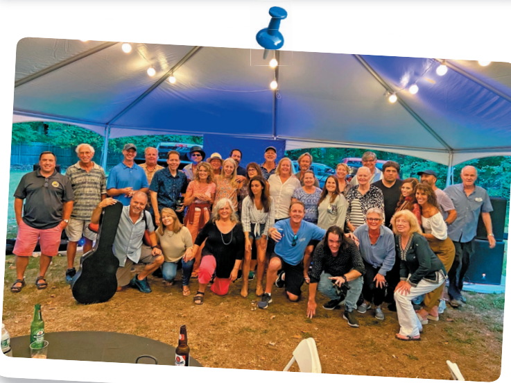
Solid 70s rocked the house at the Endless Summer Concert. Thanks to all who helped make it a great day.