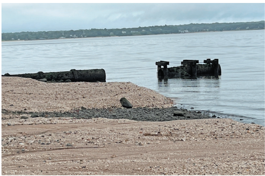
(broken pipe & VG erosion - 9/13/22)

We have a problem in that Eaton’s Neck’s eroded beaches brings high tide right up to our bulkheads. This means if a heavy rain or sustained storm event occurs during high tide, seawater and sand is pushing up into the pipe at the same time storm water is trying to get out. The competing pressures leave the water nowhere to go but up, often result in blown manhole covers behind bulkheads - or water backing up to street level and flooding. Our pipes are old and decrepit. We do need new ones that will be routinely scoped and kept clear of sand. However, outfall pipes are a last resort safety valve, not the solution. We heard construction personnel advocating for the snaking of the storm water pipe over the bulkhead at Valley Grove so water can just pour out onto the beach--thus eliminating the sand clogging and tide issue. This short-sighted “quick fix” would result in massive trenching of our already eroded beaches, be a terrible eyesore and cut a river right through our property. We must avoid such damaging quick fix suggestions by those who do not live here.