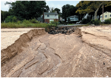
(Worcester Dr. erosion - 9/13/22)

Although the new system is supposed to localize water collection in upland (up street) areas so less comes racing downhill, it has proven it cannot handle the furious high-volume storms that are the new normal. Further, only a small portion of Eaton's Neck has received new catch basins. We need them on all the hilly streets leading down to Price's Bend as well. What was installed is insufficient to what we need. A proposed solution: more catch basins, more depressed grates so water drops in versus skimming over top (what's happening now), road grading to channel the racing water into the catch basins.