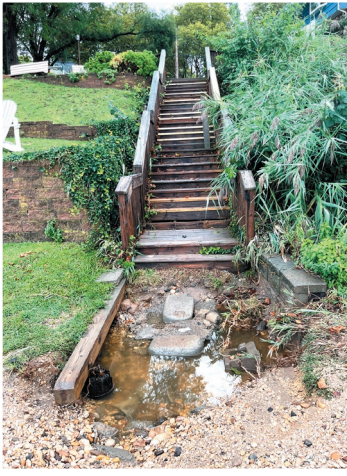
(damaged stairs at Valley Grove - 9/13/22)

Especially the old wide mouth catch basins in the sections of Eaton’s Neck that have not received new drainage. Following the Sept 13th washouts at Prices Bend and the end of Worcester, a few trucks (contracted by the TOH) were spotted cleaning some of the catch basins along Tudor and on Eaton’s Neck road, where the hills run down to the beach. This is a very good first step. Most of these catch basins have not been cleaned for over 7 years but they should be cleaned every 2-3 years. When the Town waits too long, there is an accumulation of muck and leaves that rises so high, it actually occludes the storm water pipe inside that’s supposed to carry water away (through pipes). If the pipe inside is blocked with crud, the basin fills up during a heavy rain then pushes the water back out onto the street where it all rushes downhill to the beaches, pools up at the low points along Birmingham and Worcester and eventually, jumps the curb and cuts a channel of erosion we have to deal (currently at our expense) several times a year. Regular cleaning of catch basins all over Eaton’s neck would a long way toward alleviating pressure on our system.