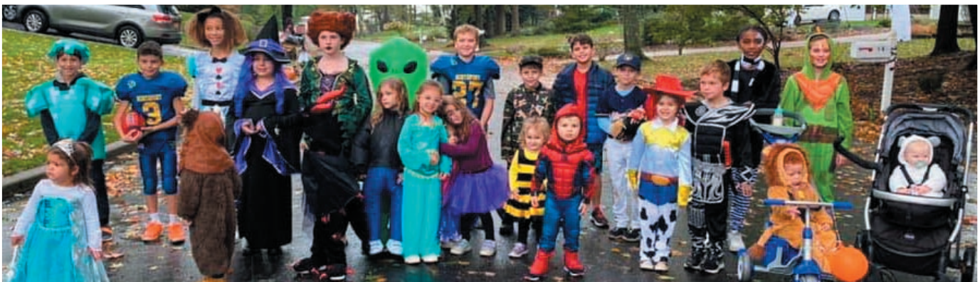
Bad weather didn't rain on our Halloween Parade!

A member drew the meeting's attention to the fact that often individual board